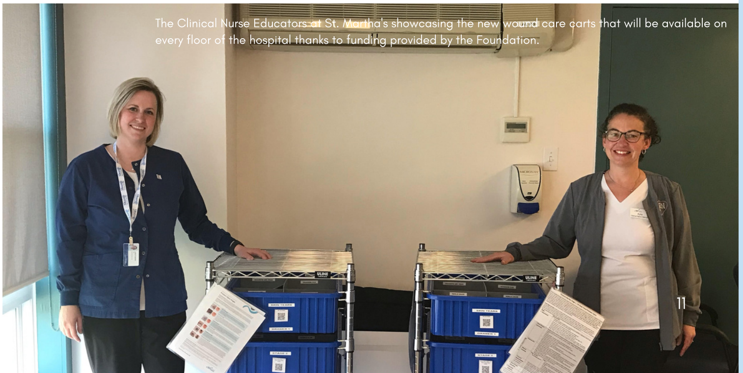
The Clinical Nurse Educators at St. Martha's showcasing the new wound care carts that will be available on every floor of the hospital thanks to funding provided by the Foundation.