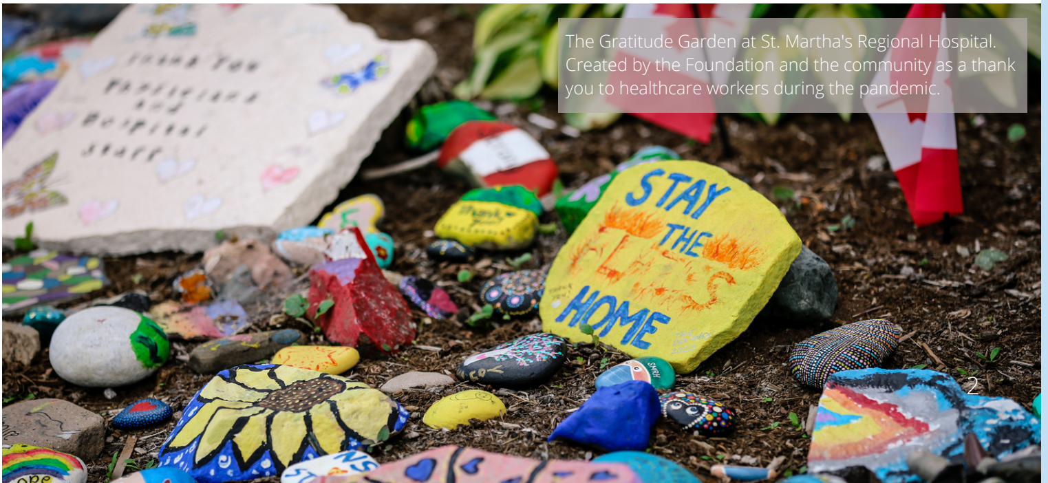
The Gratitude Garden at St. Martha's Regional Hospital. Created by the Foundation and the community as a thank you to healthcare workers during the pandemic.