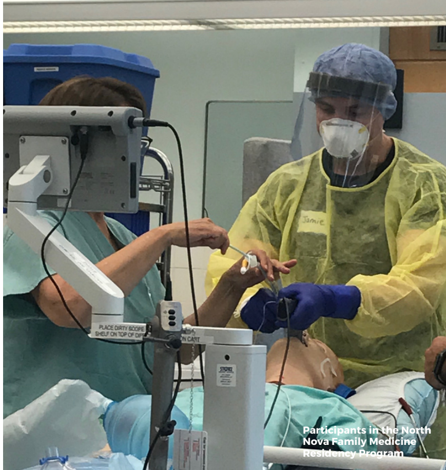
Participants in the North Nova Family Medicine Residency Program

“Simulation based medical education is the way of the present and the future. It is how medical schools are training medical students and residents, and it is how we are maintaining skills and promoting high performance teams for practicing physicians. This is what we know and what new physicians thinking about rural practice know. Having simulation-based education and training at St. Martha’s Regional Hospital positions us to attract physicians committed to lifelong learning. It also attracts physicians who have an interest in teaching and academic scholarship.